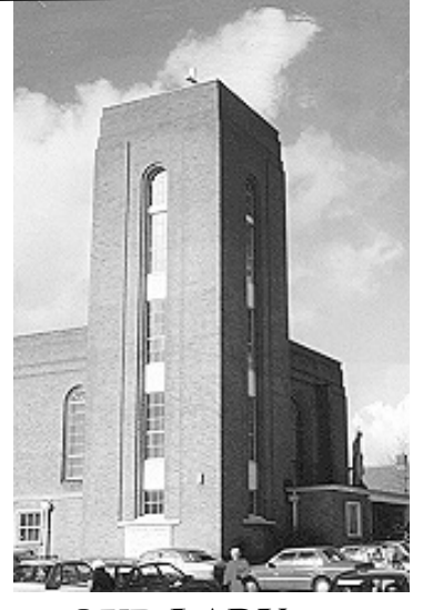
OUR LADY, QUEEN OF APOSTLES